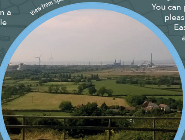
View from Spaniorum Hill

You can park in the village; please park sensibly. Easter Compton is on a bus route.