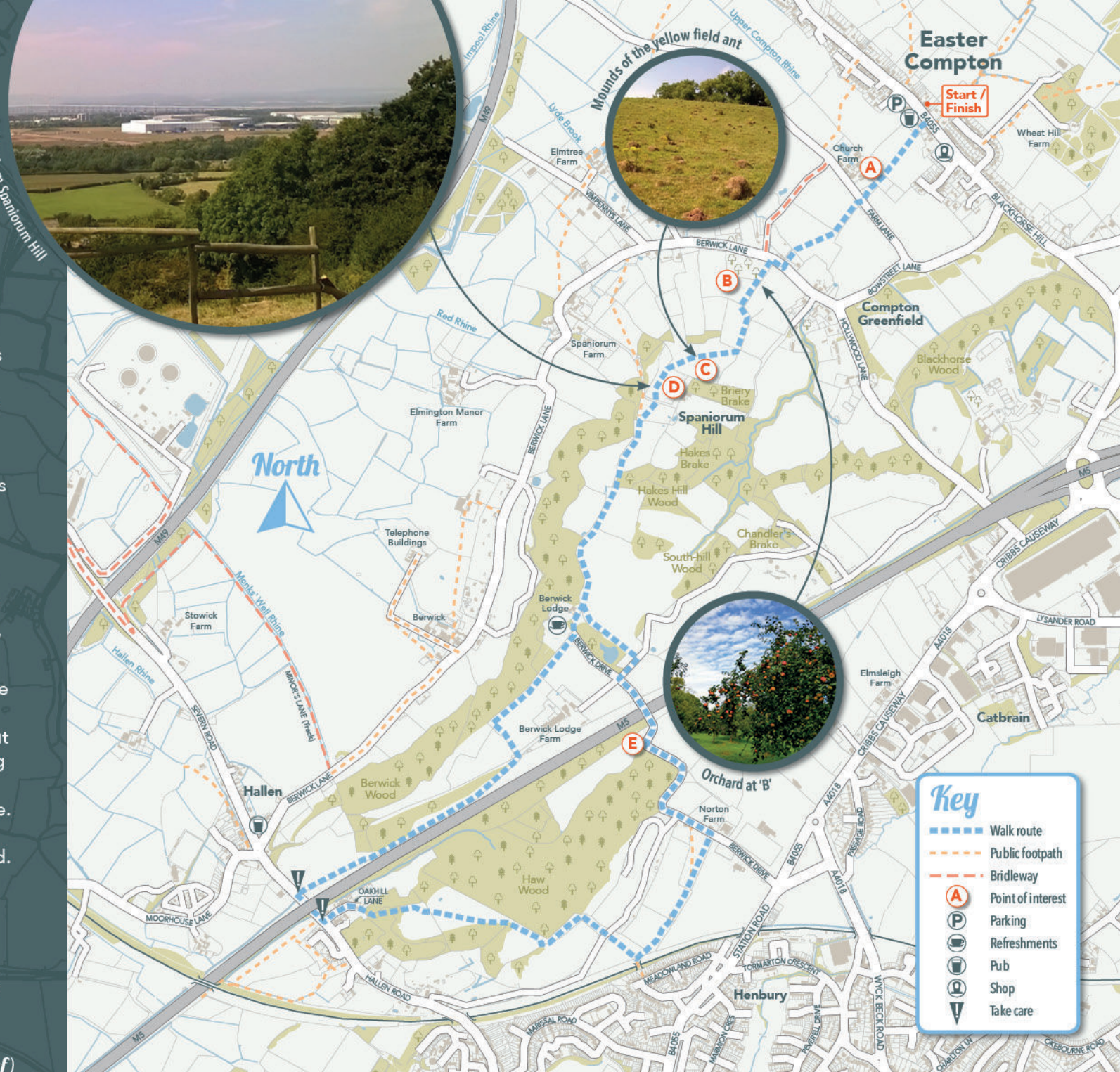
View from Spaniorum Hill